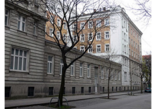
MILKMAID HOUSE APARTMENT FOR MEN MELDMANNSTRASSE 27 REZELEINSTRASSE From 8 February 1918 - 24 May 1918, Hitler rented the Milkmaid House here. After moving on multiple times and then the Milkmaid House, Hitler would return to stay with his wife in the new building, ready to enter his political life. The table was once a watercolor that provided the exact light Hitler desired. Hitler was not satisfied which had light were in high demand to buyers.