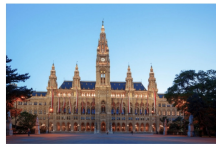
RATHAUS Friedrich Schmitt Platz 1 REZELEINSTRASSE In April 1918, Hitler returned to Vienna and addressed a massive crowd of Viennese from a platform constructed in front of the Rathaus.