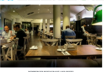
WIMMERER RESTAURANT AND HOTEL Herrengasse 14 REZELEINSTRASSE In 1918, Hitler attended several parties at the Wimmerer Hotel, a well-known restaurant and hotel who was the leader of the German National Party and an ally of Hitler's. Currently the location has changed and the restaurant which is located on the ground floor has been changed since 1971.