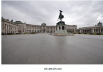
HEROES' SQUARE Heldenplatz Following the Anschluss in March 1938, Hitler delivered his welcoming speech to 100,000 plus Viennese who had assembled along the parade route onto the Heldenplatz. Hitler gave the speech from the balcony of the New Austrian Imperial Chancellery. Today the Government of Austria has banned speeches from this balcony.